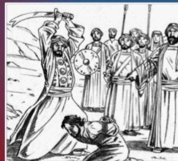
Mohammad's cousin beheads a captive