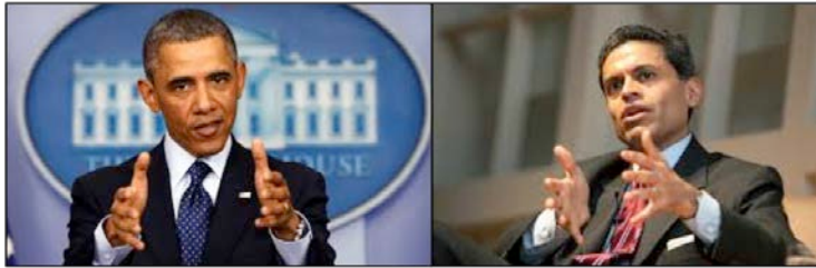
What do Barack Obama and Fareed Zakaria mean by Muslim ideology?

Zakaria should fully describe the ideology he is talking about and exactly what Muslims need to do to fix it. If Zakaria means what I think he means, and if he did say it publicly, he would probably set off a firestorm of protest by mainstream Muslims against CNN. It