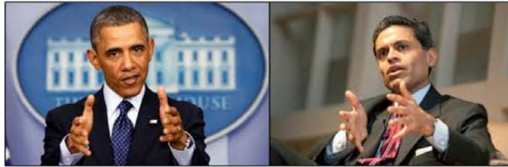
What do Barack Obama and Fareed Zakaria mean by Muslim ideology?

Zakaria should fully describe the ideology he is talking about and exactly what Muslims need to do to fix it. If Zakaria means what I think he means, and if he did say it publicly, he would probably set off a firestorm of protest by mainstream Muslims against CNN. It