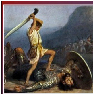
David beheads Goliath