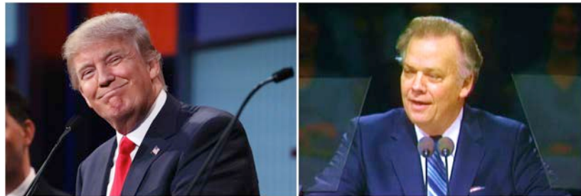
Lying with abandon. Is the greater problem the fact so many want to hear and believe the lies?