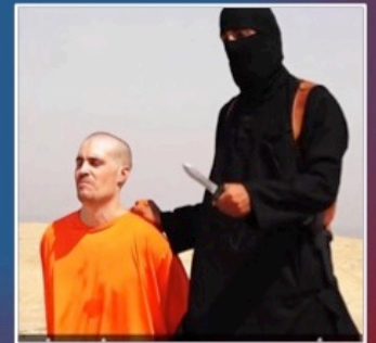
Islamist terrorist beheads a reporter