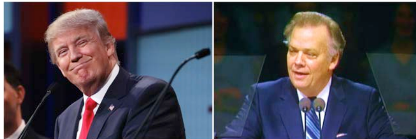
Lying with abandon. Is the greater problem the fact so many want to hear and believe the lies?