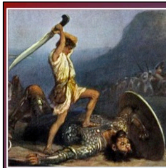
David beheads Goliath