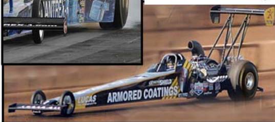
Zantrex-3 and Armored Coating Dragsters